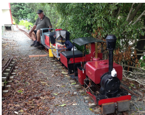
Lloyd doing a bit of shunting on Monday