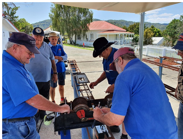
Post mortem underway on "Linus"