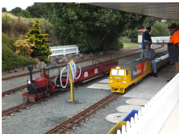
A quiet moment on Saturday