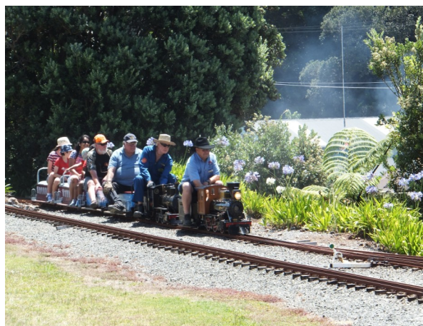
Double headers climbing the bank