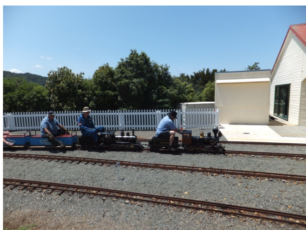
And relax back at the station