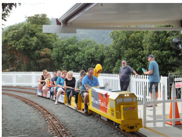
444 unloading passengers after another lap