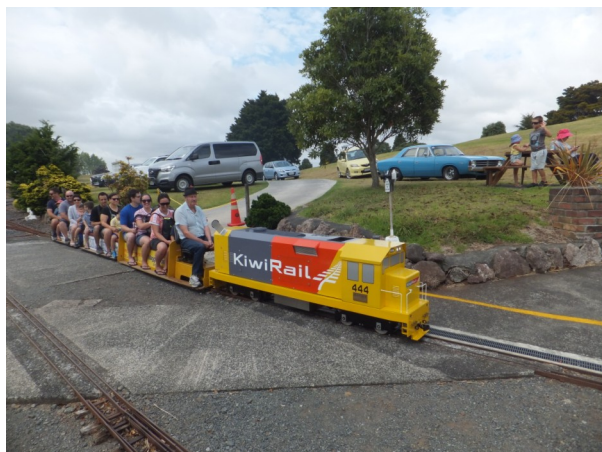
Martin with a full load behind 444