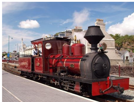
The full size Fiji at Porthmadog on the 600mm gauge Ffestiniog Railway in Wales