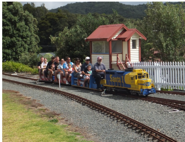
Santa Fe climbs the bank with ease