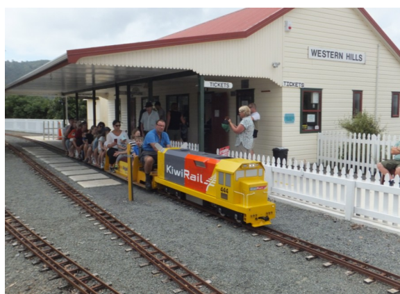
444 with another full train towards the end of the day