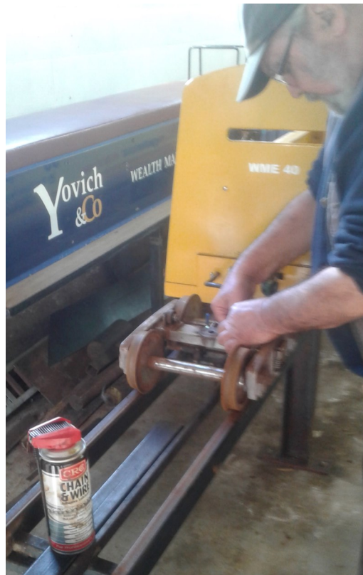
Rodney giving one of the bogies a look over