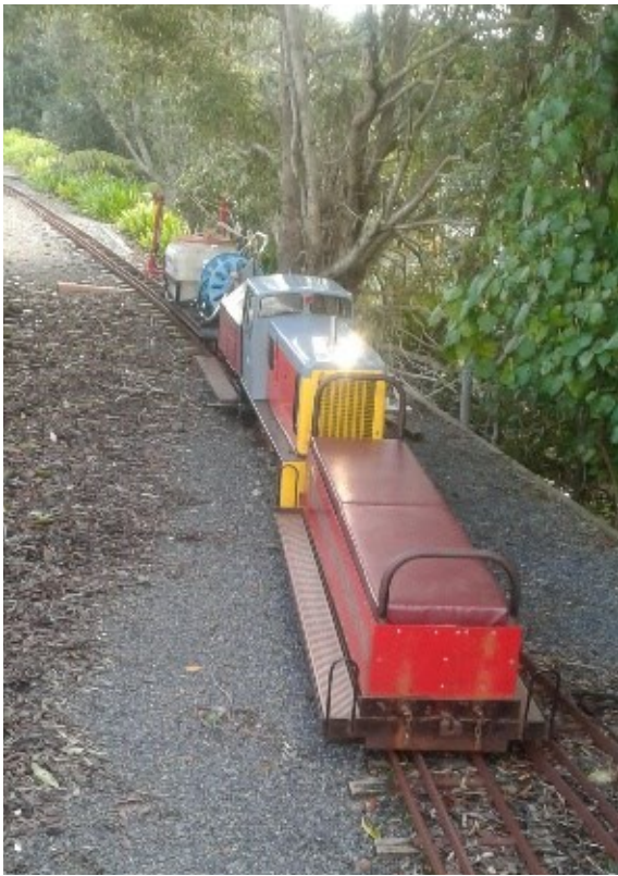
Riding car 4 being delivered to the workshop