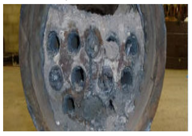
This is the dissected front tube plate of an old live-steamer. This was somewhere in the States.