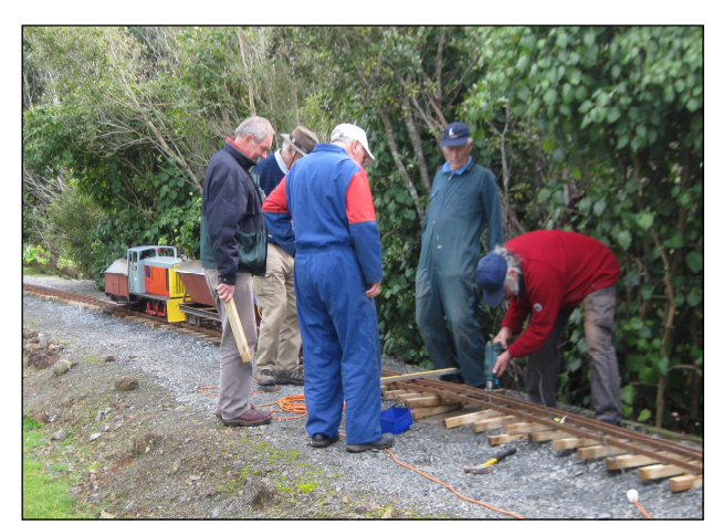
Look at all those supervisors ... and one poor sod doing all the work.